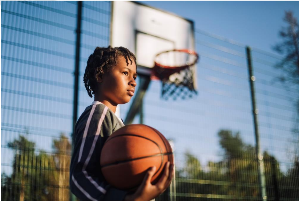
Free Stock Images, Microsoft PowerPoint.

Residential treatment settings for children should only be used short term, when clinically appropriate, and if there are no safe community alternatives due to a child's behavioral health condition.